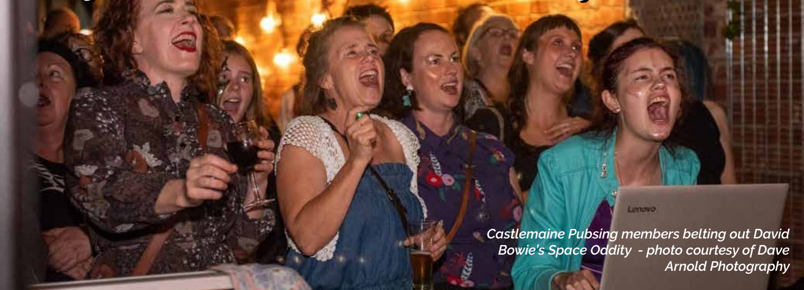
Castlemaine Pubsing members belting out David Bowie's Space Oddity

Singing in groups has become the number one community arts activity in Victoria and is a popular community arts activity across Australia and other parts of the world. There is now growing evidence to suggest that singing in groups is not only an enjoyable special interest activity but can also be beneficial for the health and wellbeing of individuals and communities.