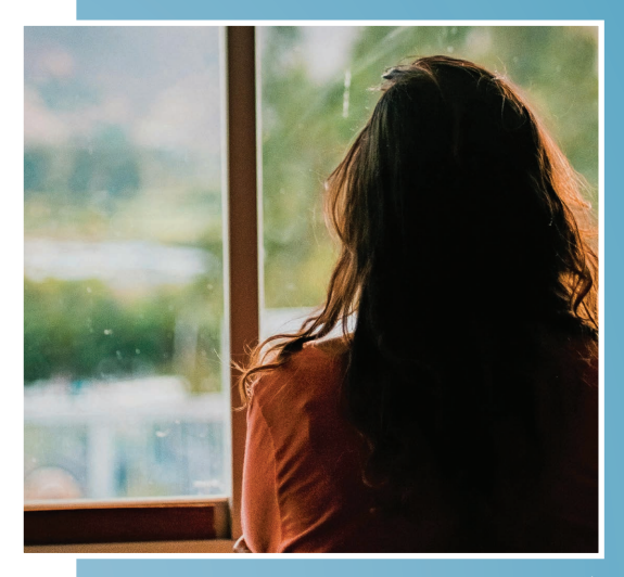
Funded by carero (355

https://commsid.podbean.com/e/kcv-podcast-34-combatting-loneliness/