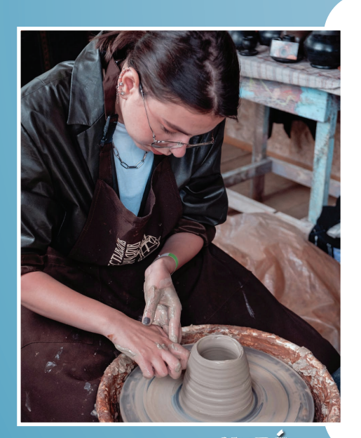
Funded by Carers (35 É